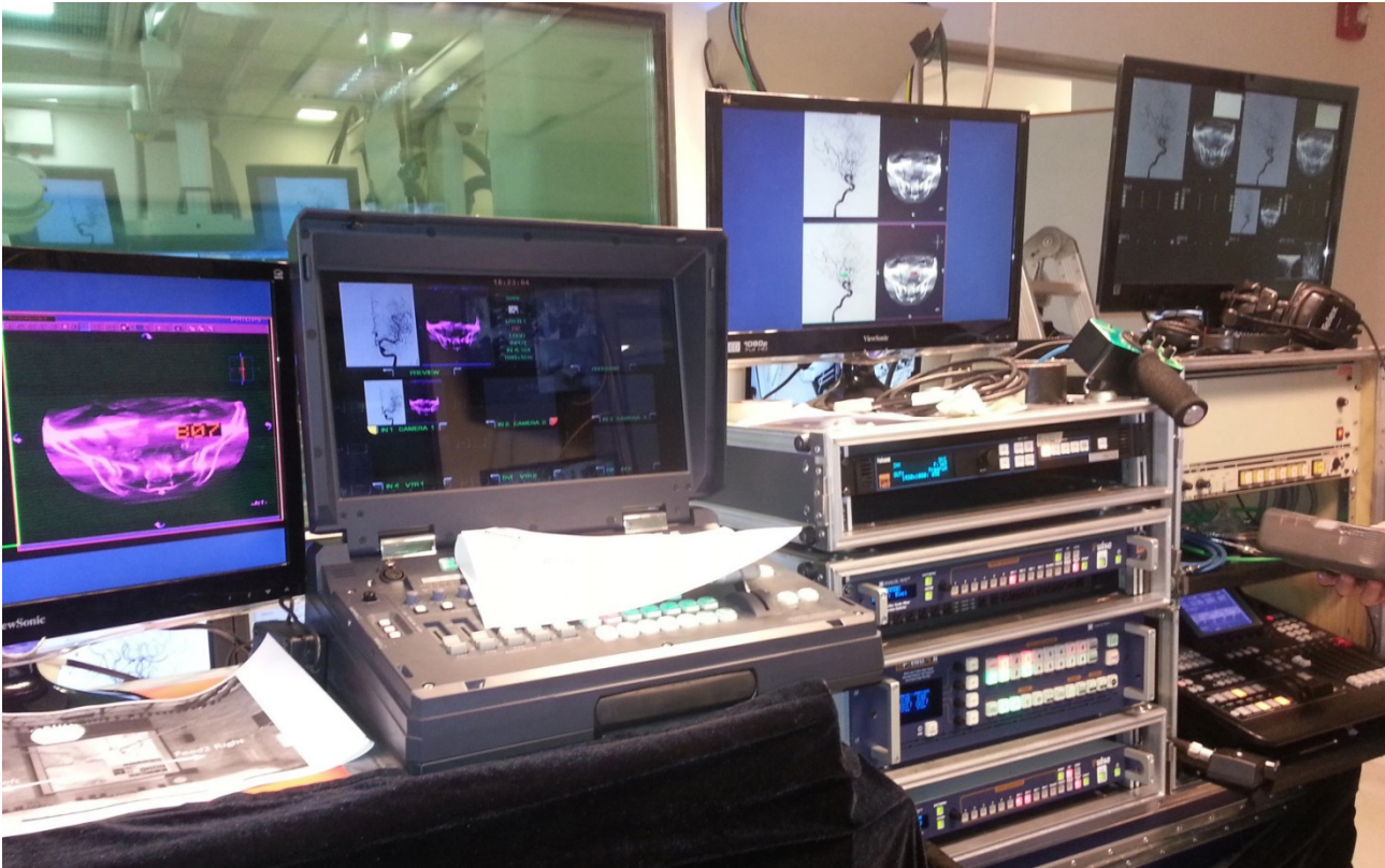
Control in front of operation room #1 in Buenos Aires - Argentina

2MGNet provided the audiovisual system for a medical event that took place at the same time in Buenos Aires, Argentina and Istanbul, Turkey. In Istanbul, several physicians attended a conference on minimally invasive brain surgery. The conference focused on operations that were performed in Buenos Aires.