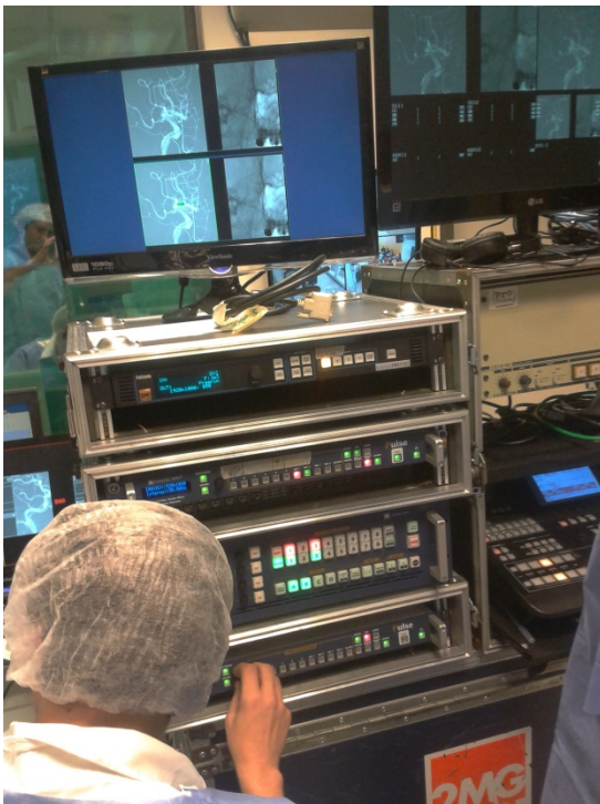
► Control for operation room #2

The Di-VentiX II was used in Mixer mode. Connected to the device there were four DVI sources plus one SDI source, signal was output in SDI (1080i). 2MGNet used several features of the Di-VentiX II for the event including layer position and cropping: "Apart from the configuration challenges which were easily solved by the Di-VentiX II capabilities, one particular advantage that the equipment provides is the layer cropping" , says Sterin. When first contacted by the coordinators on the "Turkey" side of the event, 2MGNet was provided with one of the 4 frames depicted on the medical monitor from which there would be 4 x DVI signals received. Originated from a determined medical device, each frame was showing a high definition 3D image of every blood vessel in the brain, veins and arteries. Each of the four frames had a grey/white thick stripe with numerous data and parameters that was coming down along its side, and that needed to be removed. "As we were asked to remove said stripes to send the video only, we used the Di-VentiX II's layer adjust menu to zoom in the input and obtain the source with no stripe as required" , details Sterin.