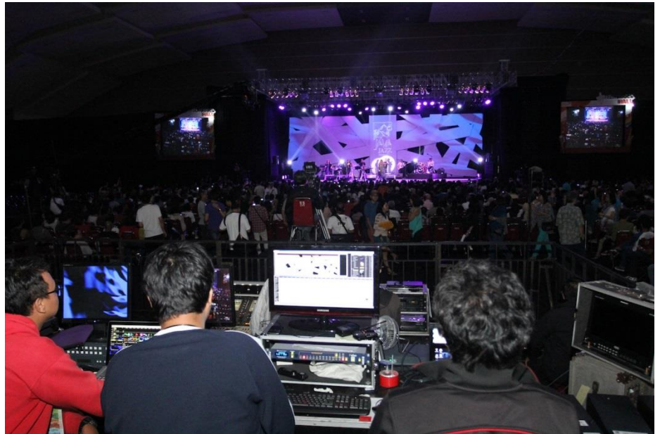
Djarum Mild Stage

A second Pulse was used for the two lateral screens fed by two projectors. The Pulse was used as an HD video mixer to convert several sources including a 3G camera into a Computer HD resolution. In addition, the Pulse inserted subtitles on lateral screens thanks to its Chroma key function. The BNI stage which was the biggest stage of the festival had exactly the same configuration as the Telkomsel stage with two Pulses to manage all the sources.